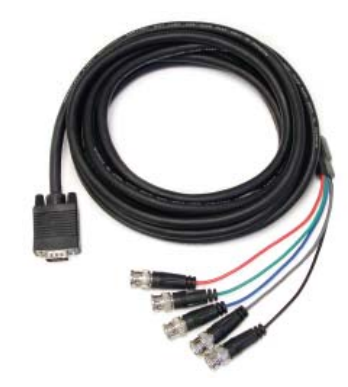
Cable: RGB-5HD15-X (X = Length in feet 6, 10, 15, 20)